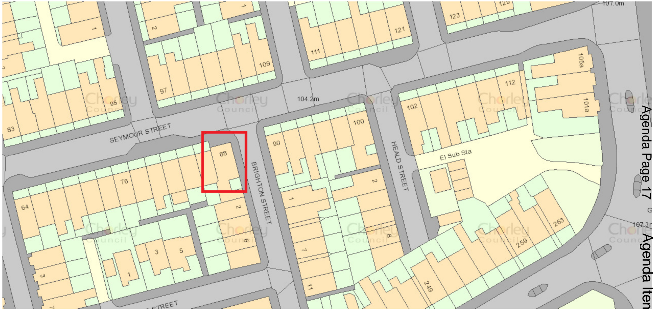
Appendix 2- Plan view of Greenwood General Store, 88 Seymour Street